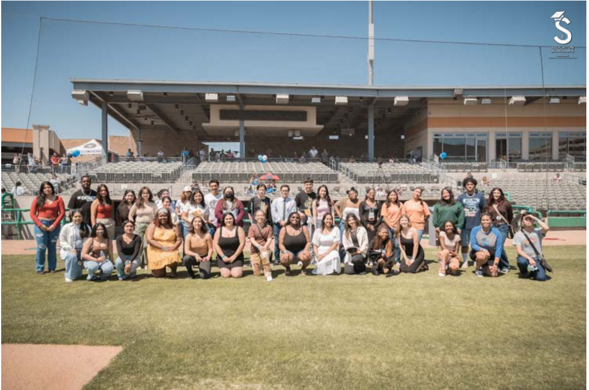
Rooted and Rising Event Banner Island Ballpark June 17th, 2023