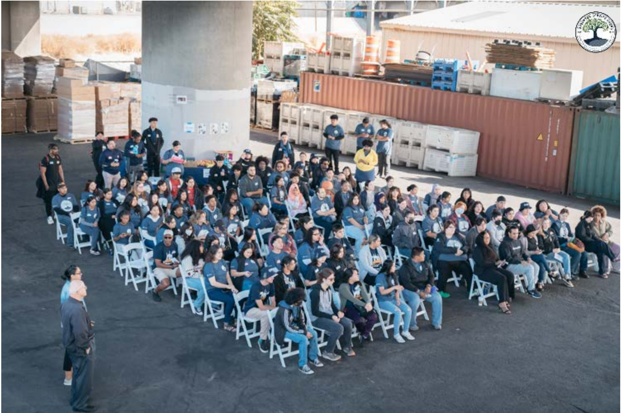
Opening Day Event Stockton Emergency FoodBank September 30th, 2023